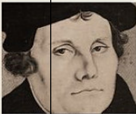
The Age of Reformation