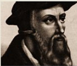
The Age of Reformation