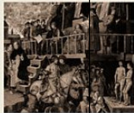
The Age of Christendom