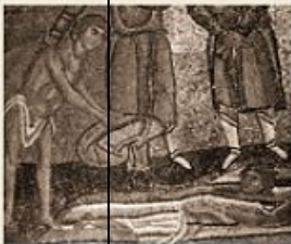
The Age of Catholic Christianity