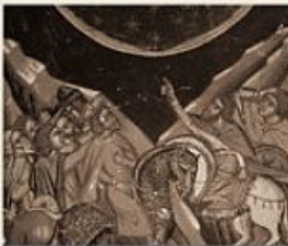
The Age of Imperial Christianity