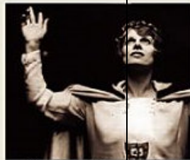
The Age of Pentecostalism