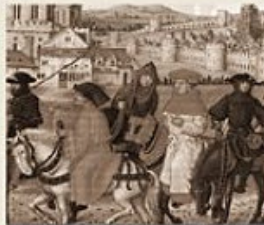
The Age of Christendom