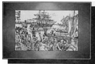
The Judsons arrive in Rangoon July 13, 1813