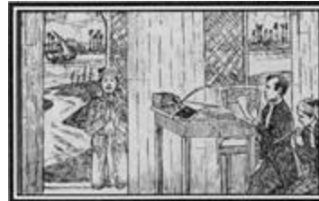
Judson dedicates the completed Burmese Bible, 1834