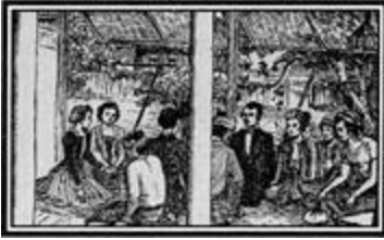
Disciples urge missionaries not to leave, 1820