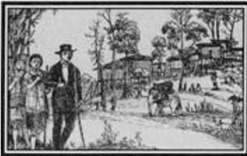
Judson visit Karen villages north of Moulimein, 1832