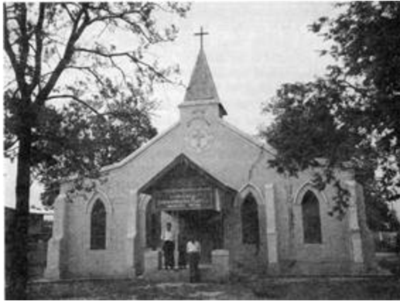
The Baptist Church at Oung-pen-la, where Judson was imprisoned

To sum up the message of Judson's life for us all today, I will appeal for renewed intercession for reformation and revival, concerts of prayer, renewed Biblical evangelism, and a new awareness of the reality of eternity and the impending judgment. These are the conditions likely to produce a new race of totally committed missionaries after the order of Adoniram Judson—missionaries that are devoted for life!