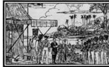
Judson interprets at Treaty of Yandabo, 1826